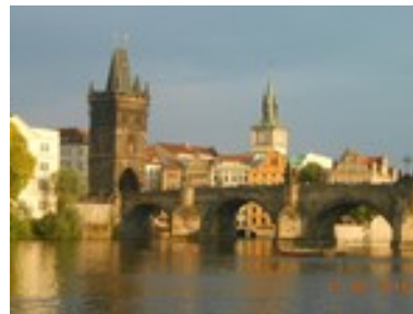
Charles Bridge from Vltava River Cruise

Day 5: The Group were free to explore Prague for the morning and part of the afternoon, prior to their departure to the airport.