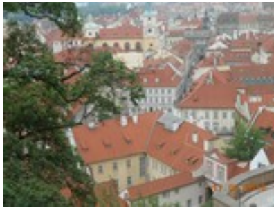
View over old Prague from Castle