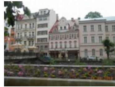
Steaming fountain at Karlovy Vary and some of the elegant buildings

After lunching in this delightful spa town, the tour continued to Mariánské Lázně, another spa town.