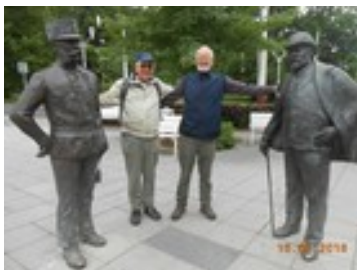
Famous Visitors to Mariánské Lázně

Mariánské Lázně is also in the west of the Province of Bohemia. The name 'Mariánské' means 'Mary' and 'Lázně' means 'baths/health resort/spa resort'. It became a fashionable spa resort in the second half of the 19th century, and among its famous visitors were Chopin, Mark Twain, Goethe, Freud, Kafka, and British king Edward VII. It's surrounded by mountain forests, mineral springs and green parks. The central Kolonáda is a baroque colonnade with bronze reliefs and a frescoed ceiling. Within the colonnade, the group had the opportunity to sample the spa water, which was not to everyone's taste! Nearby, the neoclassical 'Singing Fountain' played classical music with a magnificent water display. The large park, Bohemium Mariánské Lázně, next to the colonnade was planted with a very colourful display of spring flowers and was dotted with miniature models of Czech monuments.