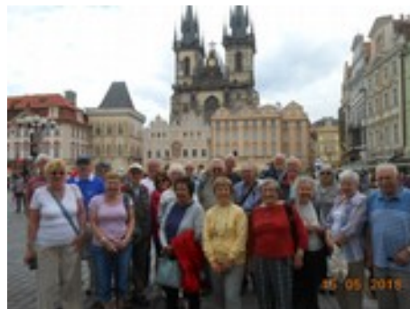
Group in front of 'Tyn' Church

Among the other notable buildings and sites seen on this tour were the Old Town Hall, the Astronomical Clock (under renovation), Celetna Street (one of the oldest