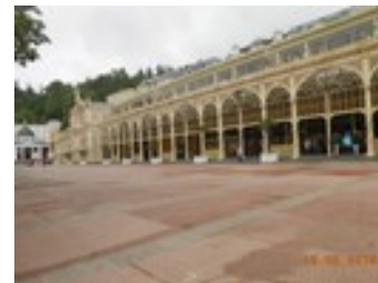
The Spa Colonnade Mariánské Lázně,

In the evening the group were again at leisure to choose where to eat, and a number of local restaurants were patronised.