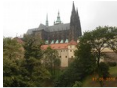
St Vitus Cathedral and Castle Wall

In the evening, the group had a most enjoyable River trip on the River Vltava . As we partook of a generous buffet meal and listened to the on-board commentary, we passed by many interesting and historic buildings such as the National Theatre and the Castle and also under the Charles Bridge.