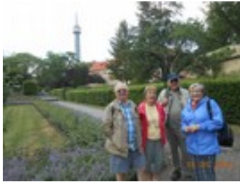
Petrin Park and Observation Tower

streets in Prague), Church of Our Lady before Tyn, and the Old Town Square. The extremely comprehensive guided tour continued through to the historic Wenceslas Square and ended at the highly decorative and much admired Charles Bridge, with its view of the Castle across the River Vltava.