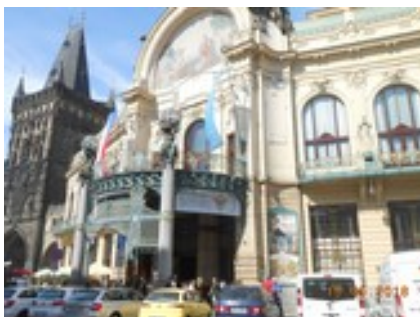
Municipal House & Powder Gate

The start proper of the Old Town tour began at the Municipal House, a striking Art Nouveau building, associated with the artist Alphonse Mucha (1860 - 1939), a Czech Art Nouveau painter and decorative artist, known best for his distinctive style, which he produced on many paintings, illustrations, advertisements and postcards. Nearby stood the Powder Gate, a much-restored Gothic gate at the entrance to the Old Town.